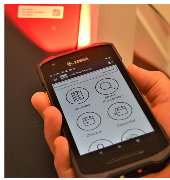
Perform inventories accurately and quickly with the A2B RFID Tracker app by scanning barcodes to capture and reconcile data and asset events.

Perform fast <u>and</u> accurate inventories/cycle counts with barcode, as well as, mobile and fixed RFID. Save significant time and improve the visibility of your critical assets, equipment and stock.